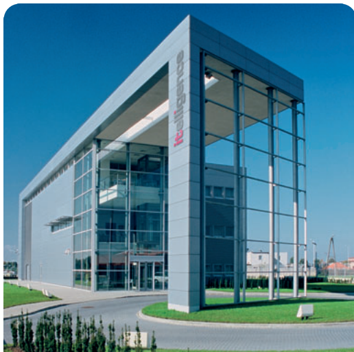
The itelligence data center in Poznan, Poland.

We recognized the need to treat mid-sized companies as if they were individuals early-on, taking into consideration the distinct processes and unique business requirements of your industry. Our proven industry expertise allows our clients to focus on their core business while we take care of the underlying technology. itelligence has developed and successfully implemented preconfigured industry solutions for a wide range of industries, based on the SAP Business All-in-One industry solution standard, for mid-sized companies worldwide.